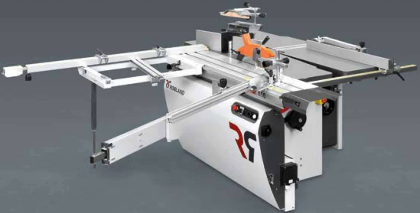
NX410 PRO with options